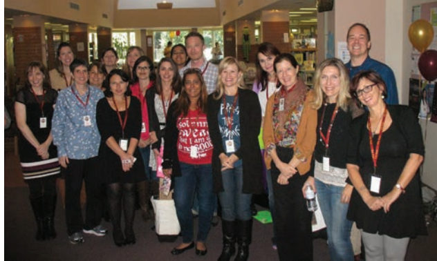
Some of the attending authors