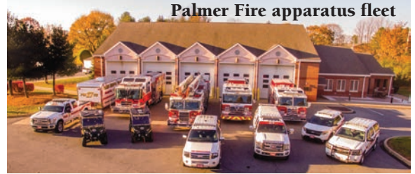
Palmer Fire apparatus fleet

Palmer Township Fire responds to hundreds of incidents a year, with a large amount of those responses being faulty smoke detectors due to the life age of the detector. If your detector has been protecting your home for some time now, check the date on the back of the detector, it may be time to start thinking of replacing it. We encourage homeowners to take your existing detector to your local hardware store to assist you in finding a replacement.