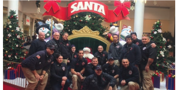
Members of Palmer Township Fire Department were honored with bringing back the Township tradition of delivering Santa to The Palmer Park Mall in December.