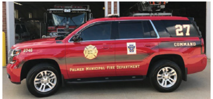
In July PMFD put in service a new command vehicle for the department. The 2017 Chevrelot Tahoe is equipped to handle all command and communication aspects of an emergency and numerous types of investigations.

Santa is planning his trip to Palmer Township and will be teaming up with Palmer Township Fire Department to make his visits. If you would like to see Santa, he will be with the firefighters on the following dates.