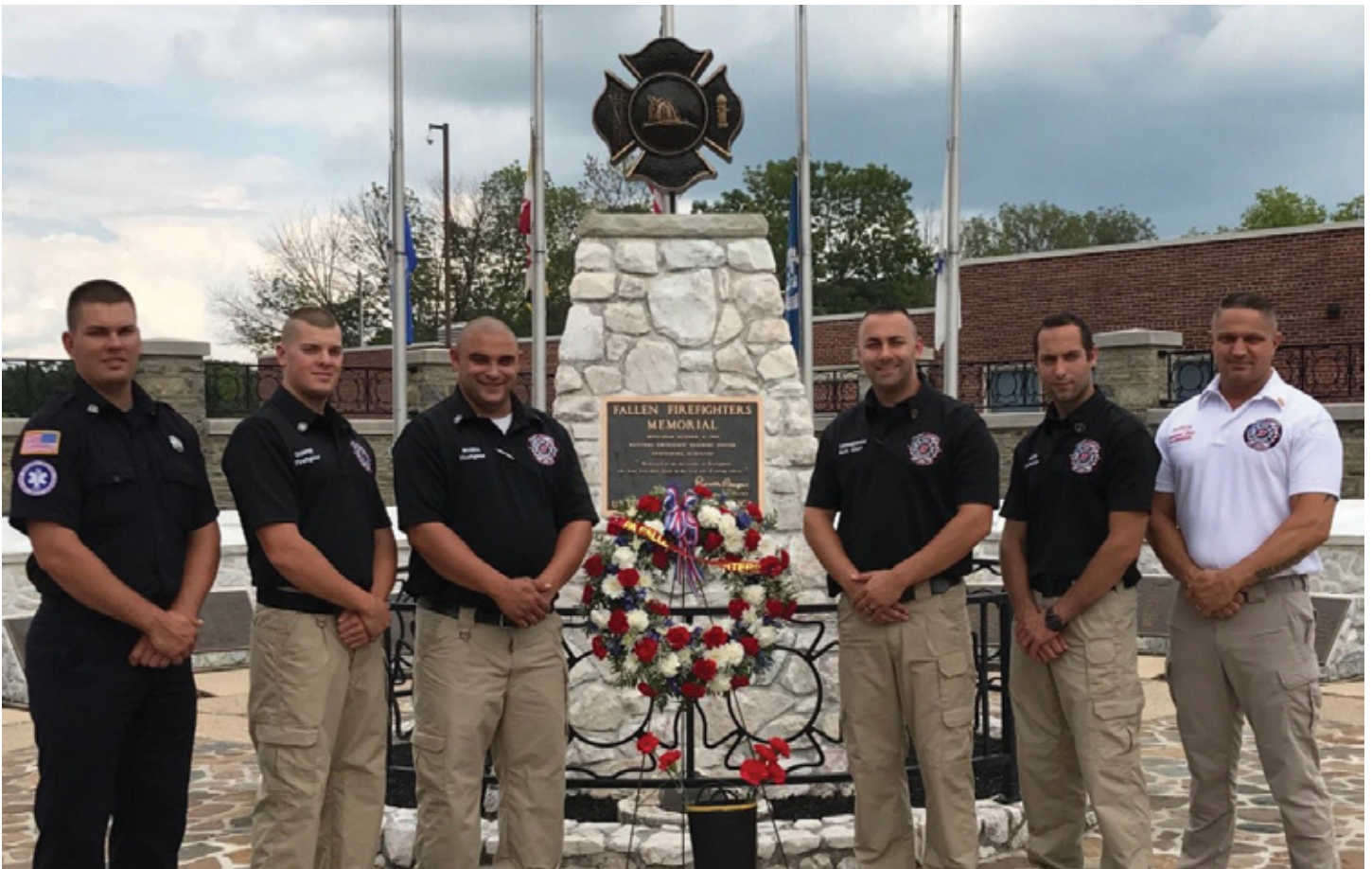
Members of PMFD attended a weekend of training at Pennsylvania Firefighters weekend at The National Fire Academy in Emmitsburg Maryland. This year members were trained in Incident Command at High Rise Fires and Contemporary Issues for Fire Chiefs. PMFD was one of five departments that represented Northampton County for PA weekend.