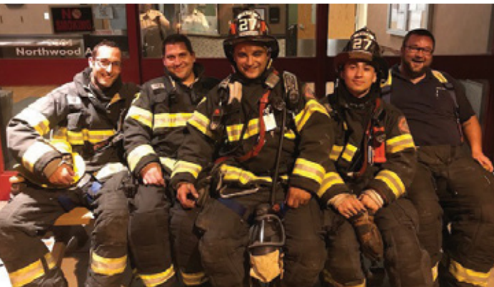
The “Station 2 Crew” is pictured taking a break during a 2 a.m. carbon monoxide incident.